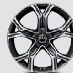
225/40R19 (front) 225/35R19 (rear) 225/45R18 all-season tires (optional on AWD)