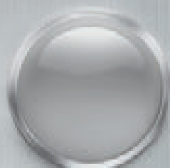
SILKY SILVER A STREAK, A GLIMMER, ENDLESS EXCITEMENT