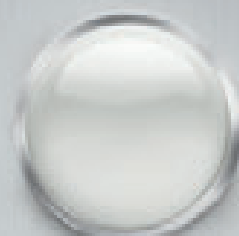
SNOW WHITE A CLEAN SLATE, IN SEARCH OF THE NEXT AMAZING STORY