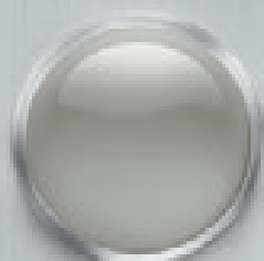
CERAMIC SILVER THE GLINT OF CUTLERY CHIMING A GLASS BEFORE A TOAST