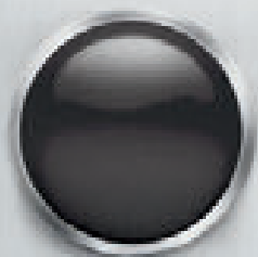
PANTHERA METAL LIMITLESS FORTITUDE, BRAVERY TEMPERED BY WISDOM