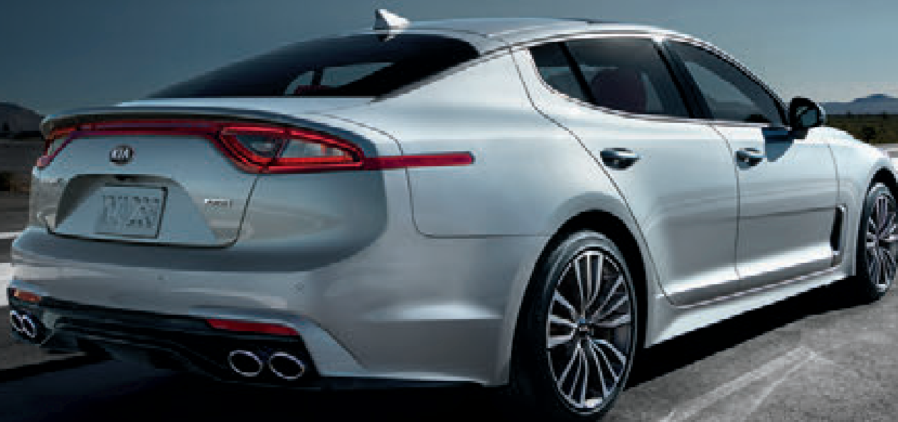
PREMIUM AWD SHOWN

Stinger's powerful 2.0L Twin Scroll turbocharged Gasoline Direct Injection (GDI) engine comes in two trim levels. These key features will help you compare.