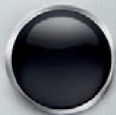
AURORA BLACK NIGHT, MYSTERY, A SPIRIT OF FEARLESS ADVENTURE