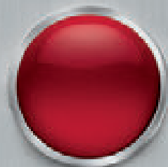
HICHROMA RED INTREPID PASSION, FERVOR, THE PULSE QUICKENING