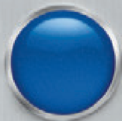
MICRO BLUE HIDDEN DEPTHS, CLEAR-EYED DISCOVERY